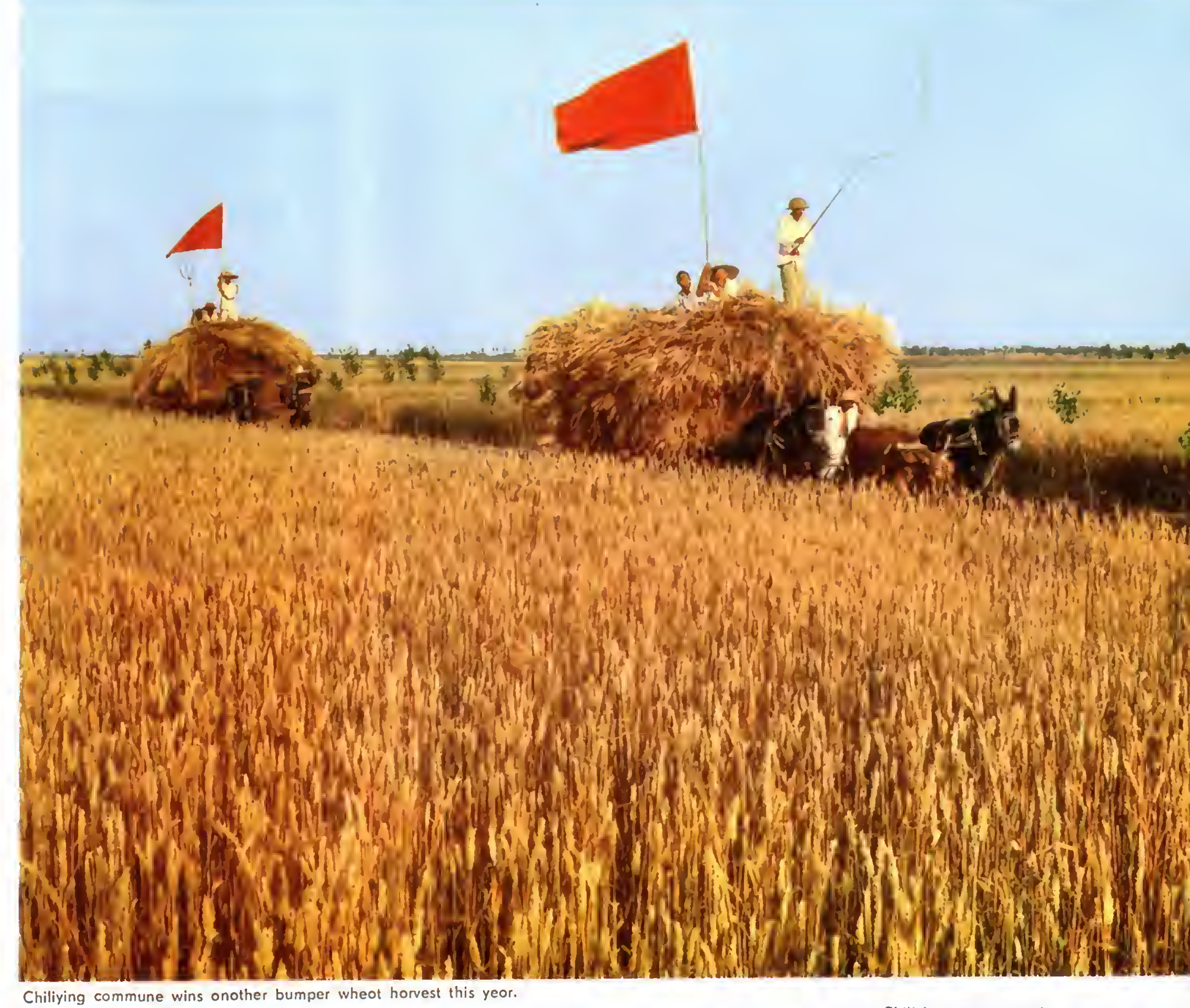
The Chiliying troctor stotion.